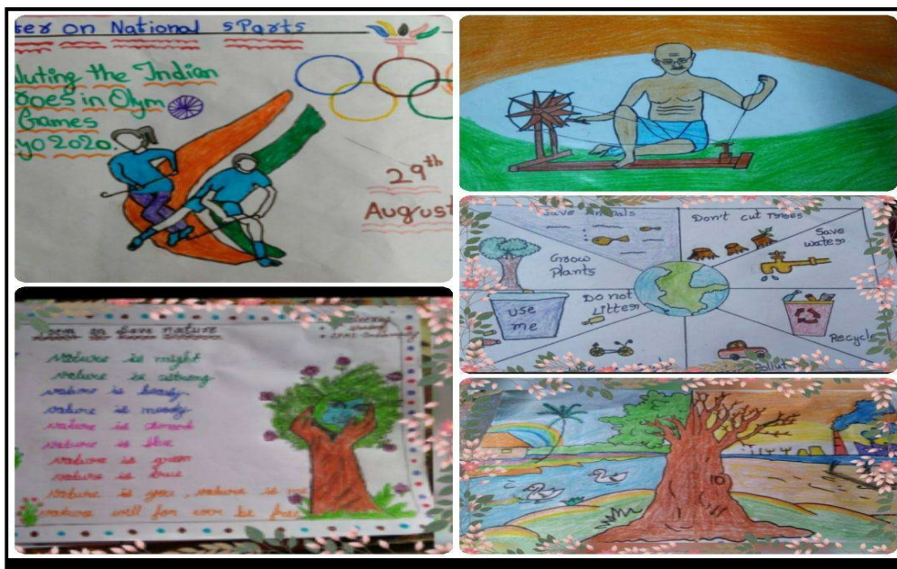
Posters prepared by students during Virtual Classes

Headmaster and teachers of the school made sure that all students should be connected to every subject teacher and prepared a timetable and also updated all class 'WhatsApp' groups and started sharing academic worksheets and previous class worksheets on some important topics. They talked with parents and enquired about students' well-being and studies. Each teacher adopted some students and took the responsibility of calling them and sending online TV classes schedule every day and monitoring that they watch regularly and also completing the worksheets in time. Learning was also ensured by preparing a quiz in all subjects using Google form and Google classroom and feedback was sent to them. All teachers also supported children in clearing their queries